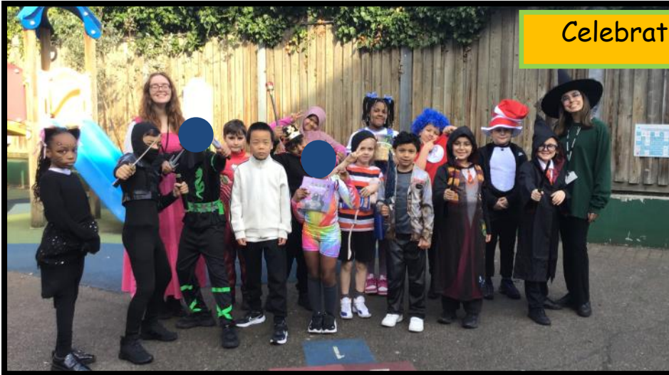
Celebrating World Book Day!

https://www.nspcc.org.uk/keeping-children-safe/online-safety/talking-child-online-safety/